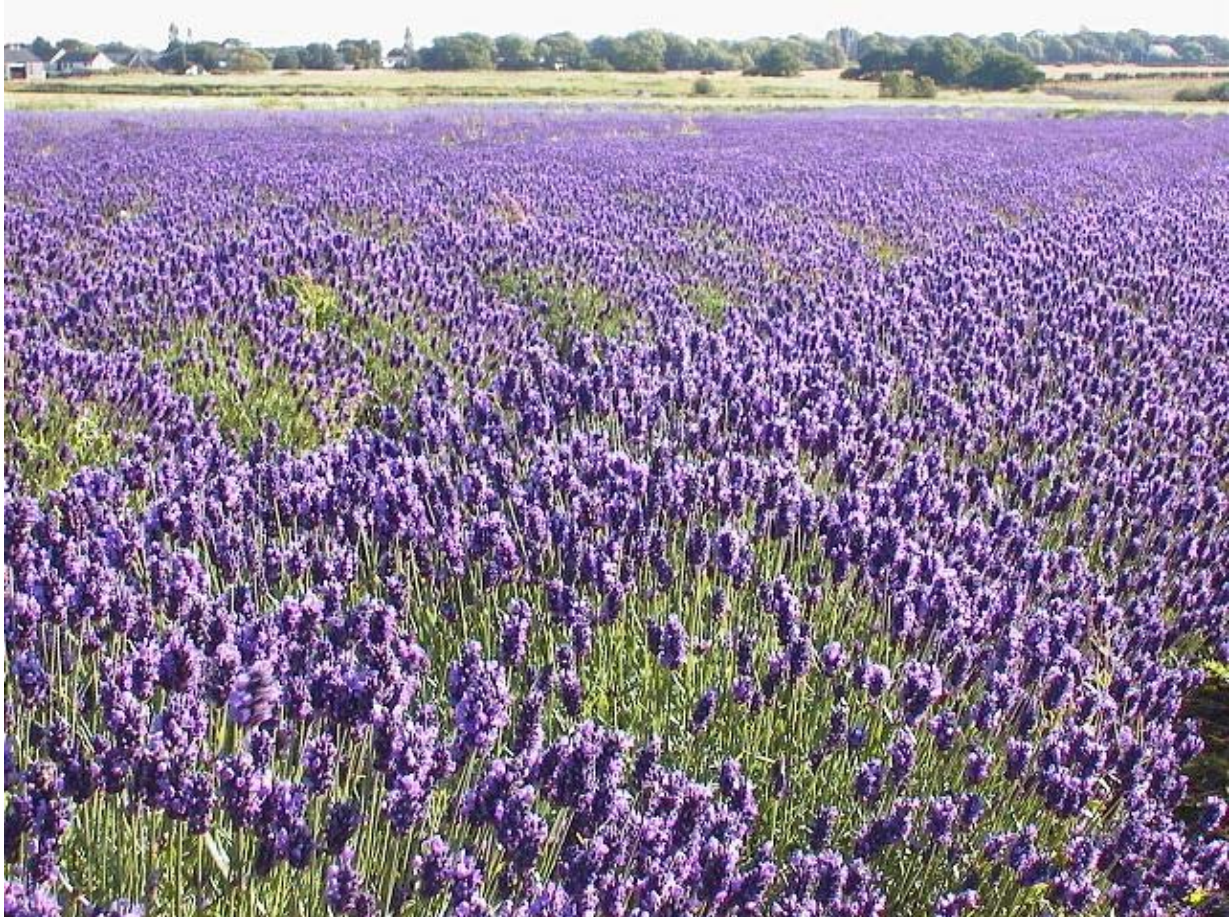
A field of lavender, Lavandula angustifolia , at the point of harvest.

bracts, petals, sepals, stamens, anthers, stigmas and ovaries. They also produce the pollen which is like sperm produced in male animals.